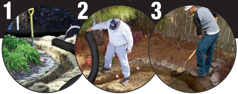
1 Dig Trench

One person can install EZflow in minutes.